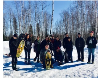
Getting ready to track wildlife